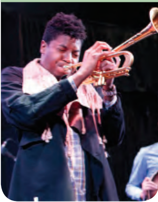
Trumpeter Christian Scott in performance at Kuumbwa Jazz Center.

KUUMBWA JAZZ CENTER is one of our county's musical stars. For over 30 years, the nonprofit performing arts venue has brought us local and international jazz talent.