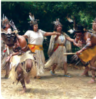
Ohlone Day at Henry Cowell State Park, a sharing of local indigenous dance, language, history and songs.

WE CAN HELP YOU support the causes you care about and receive tax benefits when you establish a donor-advised fund at your local community foundation.