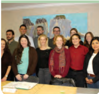
We worked with Santa Cruz Next to recruit younger people into board service.

STRENGTHENING NONPROFIT BOARDS is what our BoardMatch program is all about.